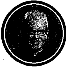
BISHOP DONALD HYING