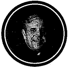
ARCHBISHOP JEROME LISTECKI